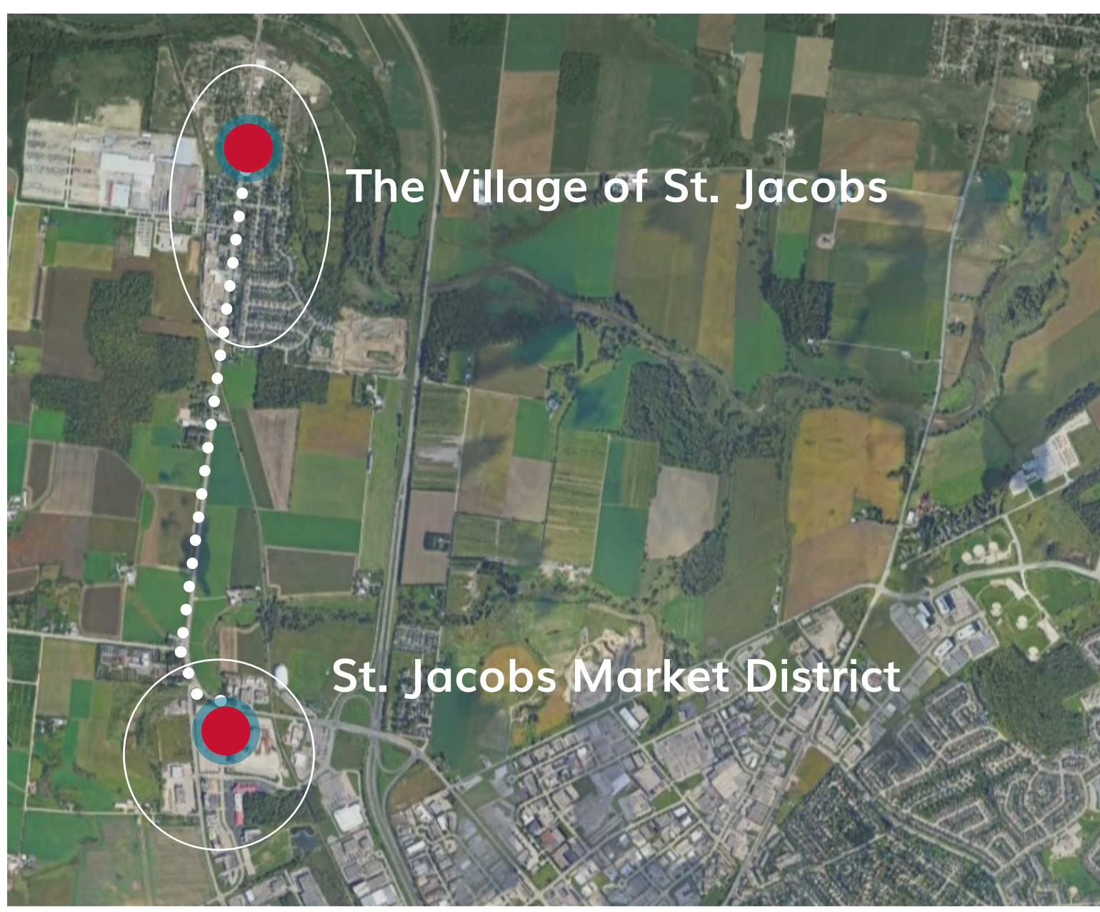
Aerial View of St. Jacobs